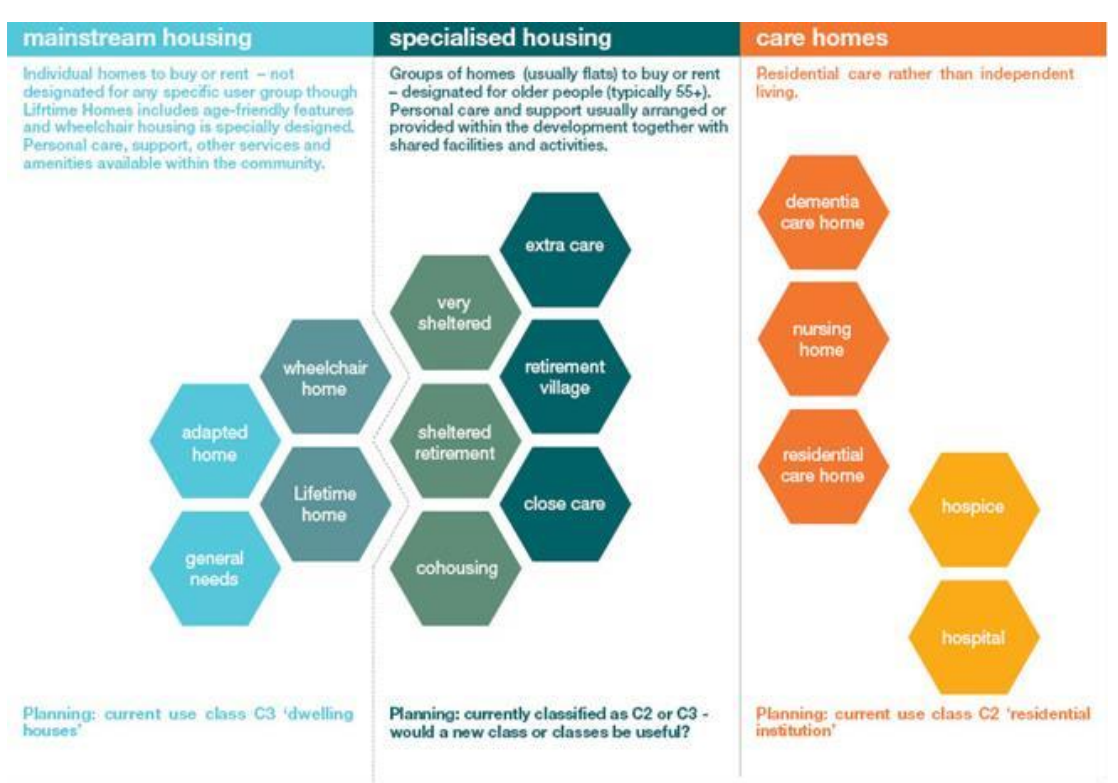
Table 4: Types of Housing for Older People

The range and variation in types of housing for older people can be confusing to many people and we have found it helpful to begin by setting out the three distinct main categories as 'mainstream housing', 'specialised housing' and 'care homes' as shown below: